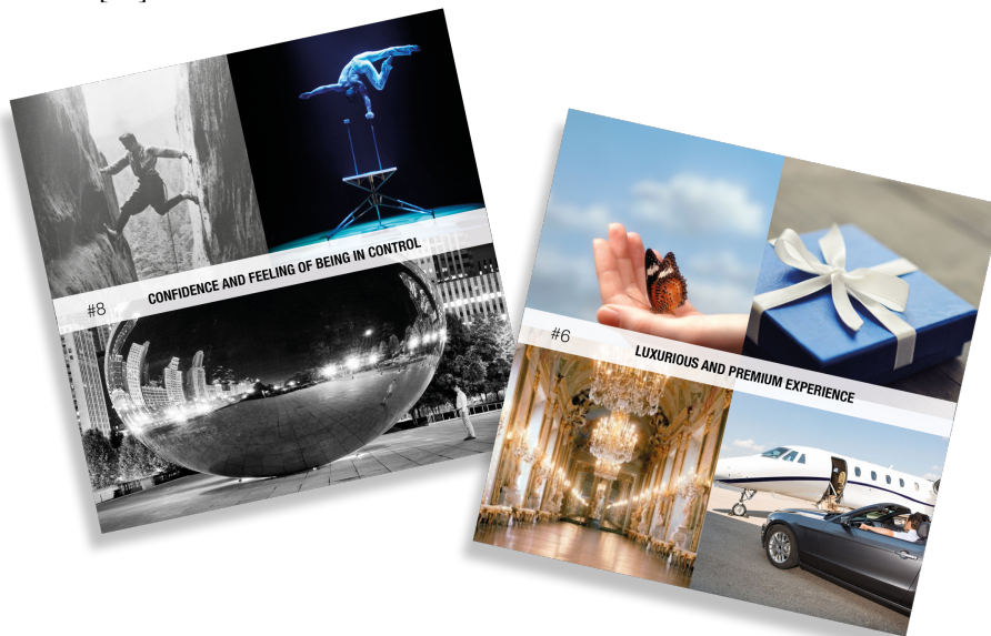
Figure 1. Examples of the Context Cards: on the left, the card of Confidence and feeling of being in control and on the right, the card of Luxurious and premium experience.

In order to better understand the bus passengers needs and expectations, and to ideate services, we conducted three co-design workshops. In co-design, users are invited to participate to the design activities together with design professionals in a continuous cooperative process that results in better solutions for daily life [23, 24]. In co-design, users are treated like experts, but since they often have very little experience on innovation it is important to provide materials that support the ideation activities [23]. The co-design materials, such as workshop tools can provide different entry points to the design problem as well as help the participants to build their own design language [14]. These co-design methods suit best for the early phases of the design process, e.g. for idea generation through brainstorming new ideas, or when rethinking existing solutions [14].