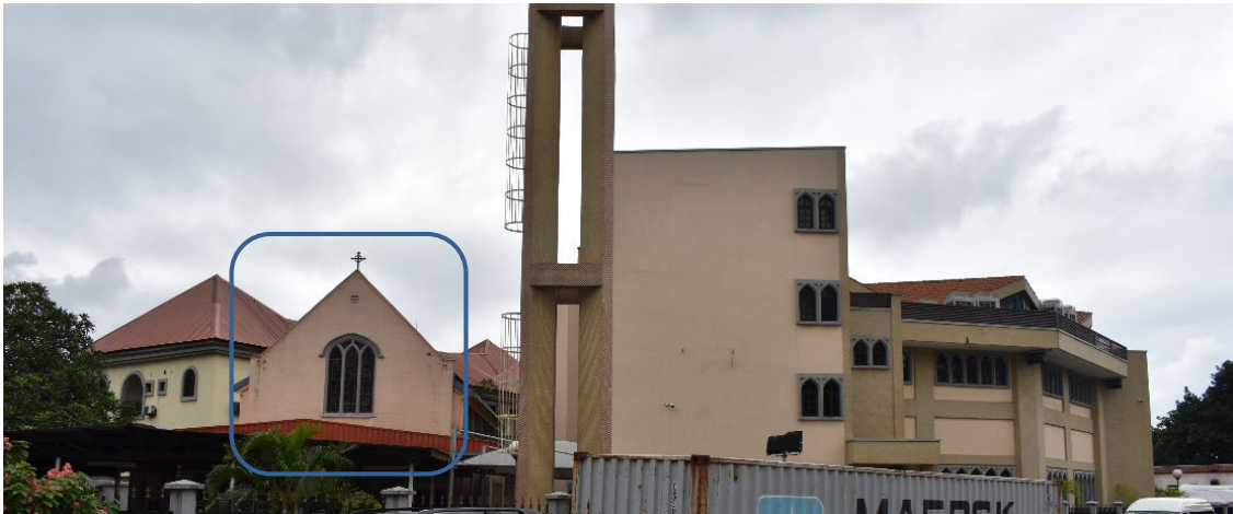
Figure 6: Our Saviour's Church (Lagos), cramped in recently constructed new church buildings