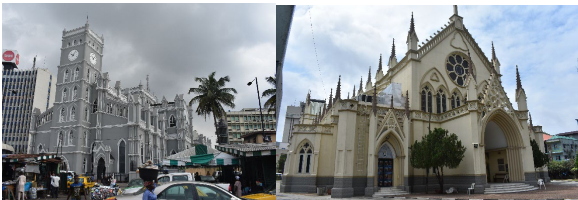
Figure 3: Christ Church Cathedral (left), and Holy Cross Church Cathedral (right) in Lagos

The emergence of church structures in Yorubaland started with the establishment of the first formal church, St Peter's Church in Ake, Abeokuta in 1847 [14] . While the early churches in Yorubaland were erected under the directives of the missionaries, these were mainly mud-and-thatch structures which did not survive. Similarly to mosques, churches with durable materials, mainly brick, stone and metal roofing sheets, started to emerge in the last quarter of the 19 th century. The 20 th century witnessed the reconstruction of these structures in larger scales to accommodate their growing congregations. The oldest surviving church building is the St. Peter's Church in Ake, built during 1898-1900. While initially the hall-type dominated, from the 1910s until the end of the colonial era, churches were designed mostly in Basilica layout. Neo-Gothic style, both in European versions and in simplified-localised versions, dominated the morphology and aesthetics of the churches from the late 19 th century, including: pointed arches, lancet windows with Gothic style mullions, oculi, archivolts, stringcourses, nave arcades with compound piers supporting pointed arches (Figure 3).