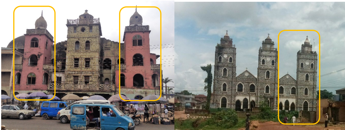
Figure 5: Modifications on Central Mosque in Osogbo (left), and Holy Trinity Church in Abeokuta (right)

Among the most radical modifications are the addition of towers in addition to congregation and administrative spaces. For the mosques, a case in point is the Central Mosque of Osogbo, where two new minaret-towers were added to the existing tower and single hall layout mosque in ongoing extension work started c.1995. The new square minaret-towers are similar to the original tower (Figure 5). However, a massive dome was installed as an afterthought to the expanded section which does not suit the building. The facades of the original mosque have been obliterated as the building was expanded. Overall, the expansion is too massive and the morphology of the new additions cause confusion rather than harmonious integration. In a similar vein, a new hall and a bell-tower was added to the originally two-bell-towered Holy Trinity Church in Abeokuta, replicating the existing ones, and making it difficult to differentiate the newly added parts from the originally existing ones (Figure 5).