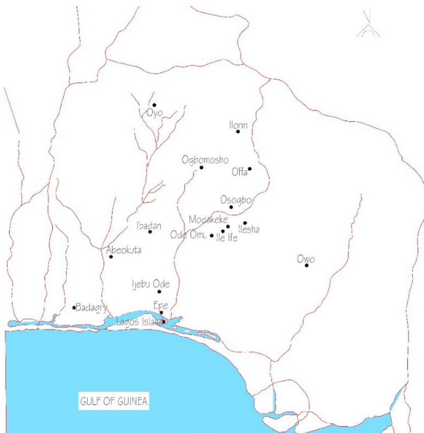
Figure 1: Map of Yorubaland showing the towns/cities surveyed for British colonial-era built religious architecture

Recent research has indicated how in the absence of heritage management policy and governmental and institutional reluctance to heritagize both Islamic and Christian religious structures has accelerated their deterioration and loss [5, 6]. This paper is one of the outcomes of a fieldwork-based research project that aims to identify, document and analyze the conservation state of British colonial era built religious heritage in Yorubaland (Figure 1). The fieldwork was conducted over several trips in a period between June 2017 and December 2019. This paper widens the discussion by looking into the existing conservation knowledge separately for mosques and churches, aiming to reveal comparative insights. By employing participant observation and semi-structured interviews with the members of the Building Committees of the surveyed mosque and church structures, it specifically investigates the problems underlying physical modifications on the fabric of buildings and examines the solutions adopted.