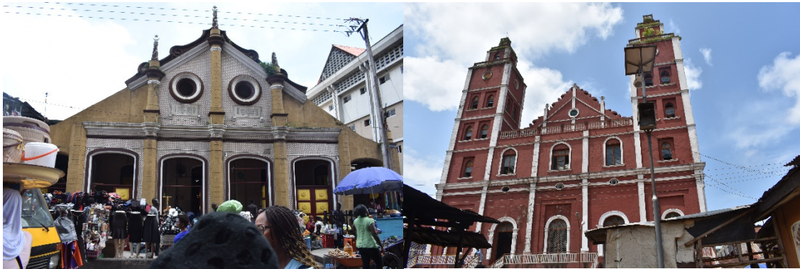
Figure 2: Shitta Bey Mosque in Lagos (left), and Central Mosque in Abeokuta (right)