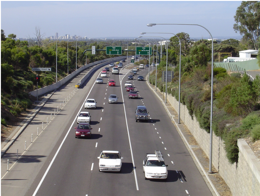
Figure 3: Reversible traffic flows on the Southern Expressway – (top) morning northbound, (bottom) evening southbound.