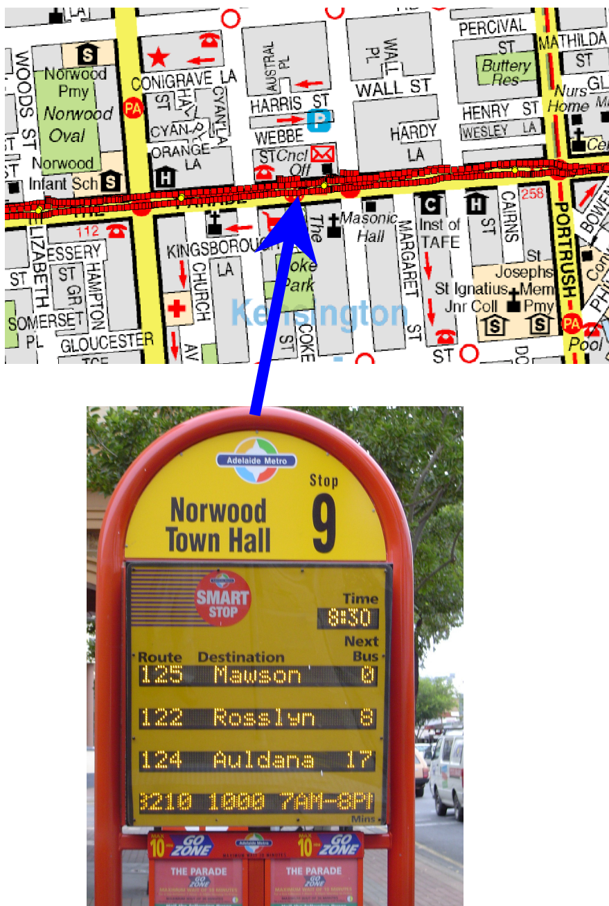
Figure 4: ‘Smart’ stop on a CBD bound bus route in Adelaide, showing stop location and real time display. Map also shows GPS traces of buses.