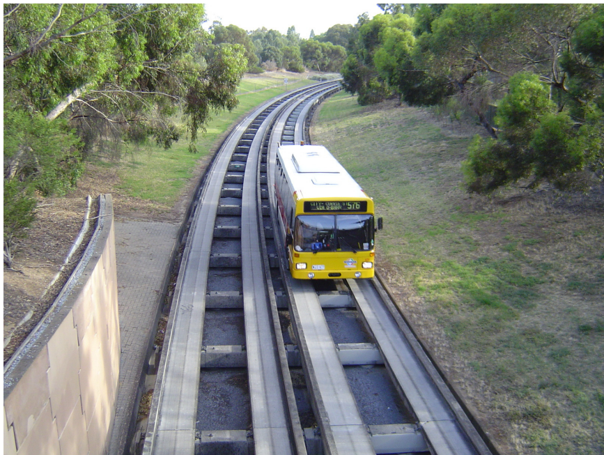
Figure 1: A bus using the Adelaide O-Bahn guided busway.

viewed in context – the general performance of public transport in metropolitan Adelaide is poor in direct economic terms, with the operating cost of O-Bahn buses being less than two-thirds of that for regular buses [4] and average occupancy levels for O-Bahn buses are almost twice those of conventional buses [7]. Relative to