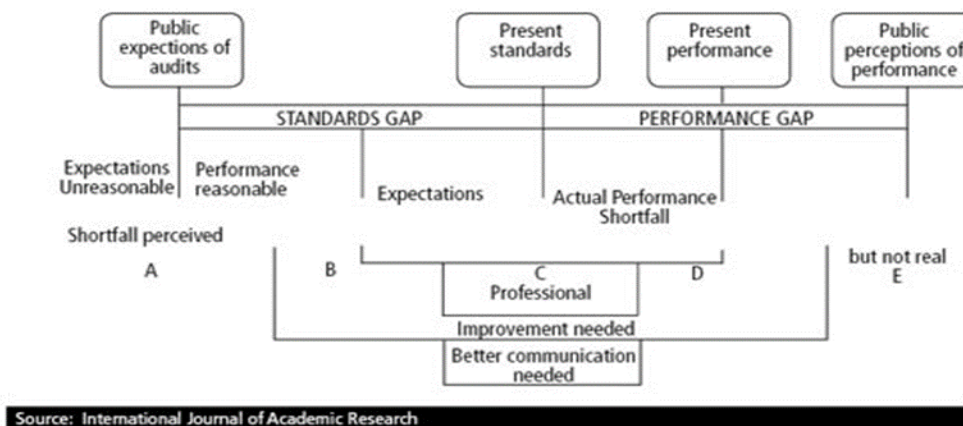
Fig 1: Audit Expectation Gap Model

The model analyses the individual components of the gap into unreasonable expectation, deficit performance and deficit standard